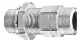
Dimensions in Millimeters (Inches)