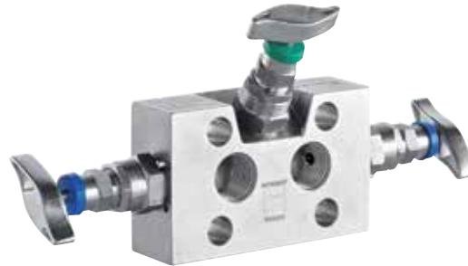
STYLE A (DIRECT MOUNT)*