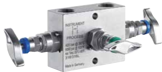
STYLE B (REMOTE MOUNT)

*Compatible with Ashcroft type 5503 gauge only