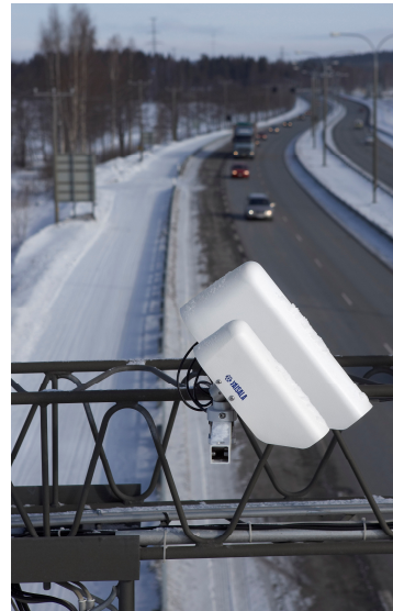
Fig. 2 Non-intrusive sensors mounted on an overhead gantry

The capabilities of the non-intrusive optical sensors have already been tested and a number of papers have been published; one is called Vaisala Remote Road Surface State Sensor DSC111 and the other Vaisala Remote Road Surface Temperature Sensor DST111. These sensors are remote in the sense that they can be installed on any post by the road side or a gantry across the road. Thus installation is fully non-intrusive, i.e. there is no need to install anything on the road surface.