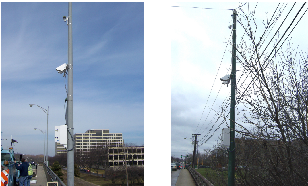
Fig. 5 Non-intrusive sensors mounted on existing street furniture in Chicago

It has already been mentioned that most of the traditional ESS currently deployed in the USA are mounted on dedicated 10m masts, usually constructed on poured concrete bases. Since there is no requirement for the associated atmospheric data for the operation of the non-intrusive sensors, we do not necessarily have to utilize dedicated structures. Also the embedded pucks have to be 'cut' in to the road, which also means that the road has to be closed with the necessary traffic management in place and the associated dangers due to the exposure of the workforce. By comparison, non-intrusive road sensors can be mounted on existing street furniture, see Fig.5, which dramatically cuts down on installation costs. This is extremely pertinent to smaller authorities, such as Public Works departments, many of whom have very tight budgets.