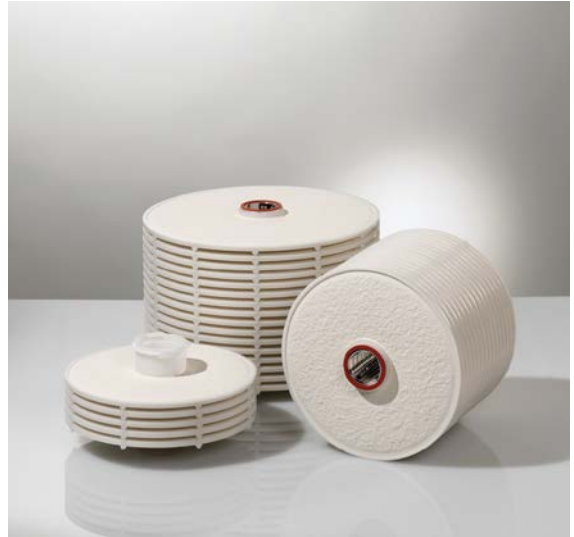
Water throughput BECODISC BT range

Polishing filtration of concentrated sugar solutions of approx. 65 °Brix and filtration of edible oils, vegetable extracts, liquid gelatin, and ointment bases consisting of primary products, oils, varnishes, polymer dispersions and separation of bleaching earth. Possible applications also include removing of activated carbon. Depending upon particle distribution of the activated carbon a single step filtration is possible.