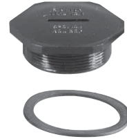
Dimensions in Millimeters (Inches)