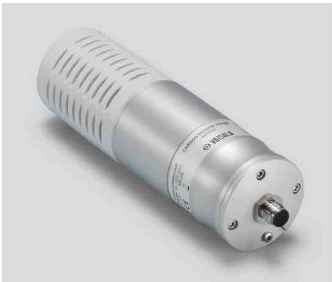
GMP343 for outdoor measurements