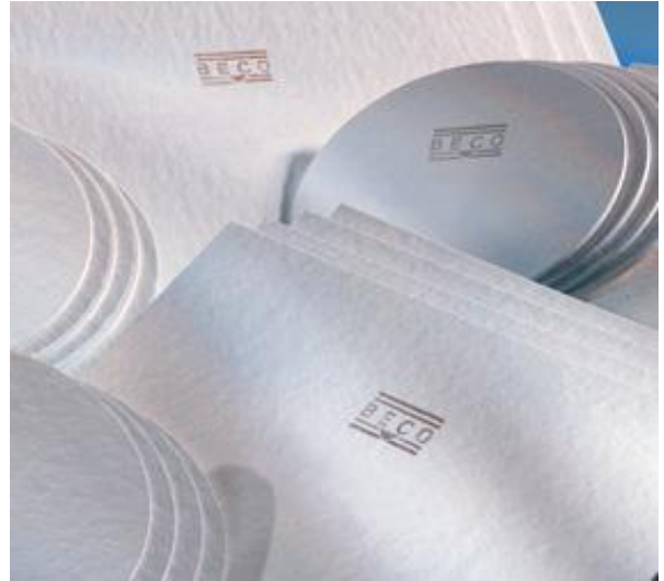
Water throughput BECO CPS range

Polishing filtration of concentrated sugar solution at approx. 65 °Brix and filtration of cooking oils, vegetable extracts, gelatin broths, ointment bases, oils, and filtration of Fuller's earth. Another area of application is separating activated carbon. Depending on the grain size distribution the separation in single-stage fine filtration is even possible.