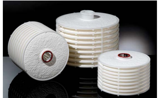
Water throughput BECODISC range

BECODISC stacked disc cartridges are suitable for applications involving primarily mechanical separation of particles from aggressive media, for example, catalyst and/or activated carbon removal. For applications where the important substance should remain in the filtrate, e.g., in the flavor or cosmetic industry, the BECODISC is ideal due to the low charge-related adsorption.