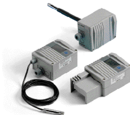
The housing of HMP140 transmitters provides IP65 protection from dust and sprayed water, so these are suitable instruments for humid spaces and outdoor installations.

In the Huurre Ski Tunnel in Finland, optimal conditions are always guaranteed. Vaisala transmitters play an important role at this indoor ski track, continuously measuring the prevailing humidity, temperature and carbon dioxide levels.