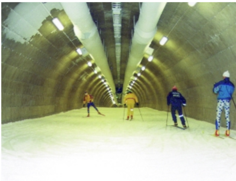
The Ski Tunnel has attracted skiers from all over the world.

NuAire's experiences with Vaisala instruments have been good. So far, we have installed ten systems with Vaisala sensors, and they have measured up to our expectations. All the transmitters are working fine. ■