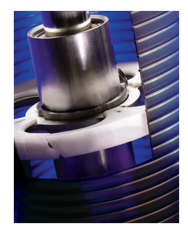
Eaton's unique spring loaded cleaning disc ensures intimate contact with the filtration screen to thoroughly and uniformly clean the media