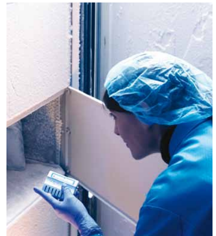
Ideal for mapping ICH Stability areas, Freezers, Refrigerators, Incubators and Warehouses.