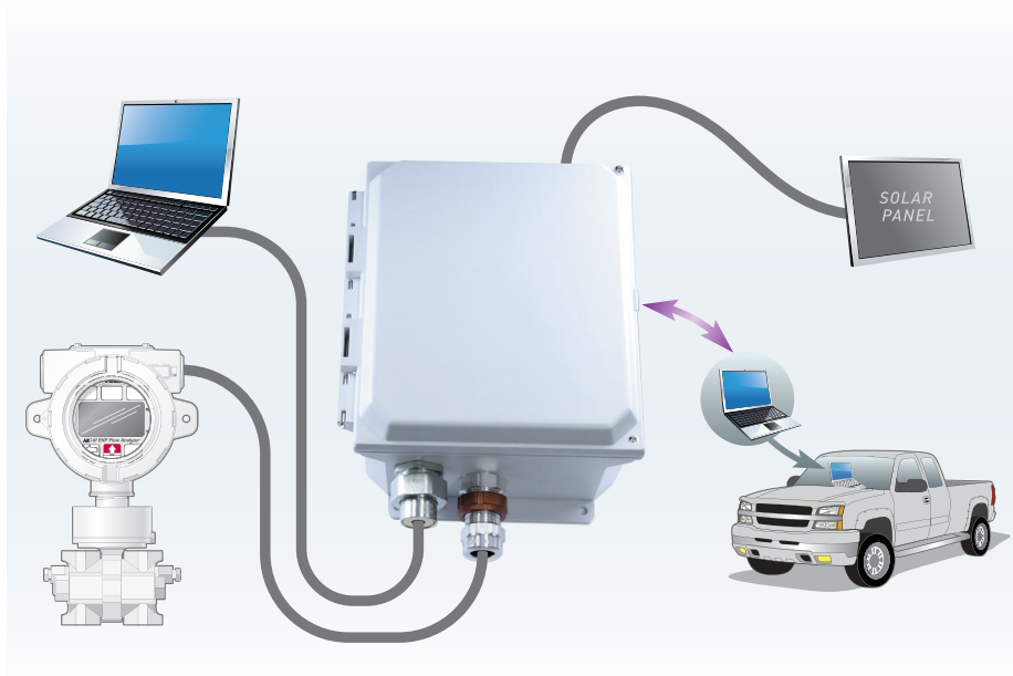
Solar/Wi-Fi Accessory Package

Automation of flow measurement and control requires remote access to equipment controls and data, but adding the necessary radios and power accessories can be a challenge.