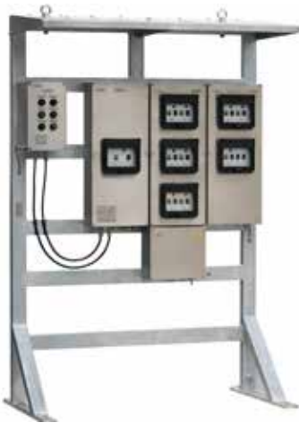
PlexPower™ IEC with stainless steel enclosure on switchrack