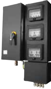
PlexPower™ IEC with fiberglass reinforced polyester enclosure