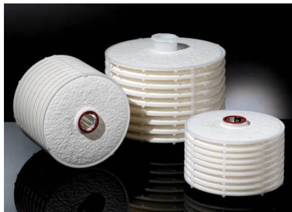
Water throughput BECODISC P range

BECODISC P stacked disc cartridges are suitable for applications involving mechanical separation of particles and adsorptive retention of negatively charged particles. Due to the minimum endotoxin contents and the increased endotoxin reduction the depth filter medium is ideal for pharmaceutical processes.